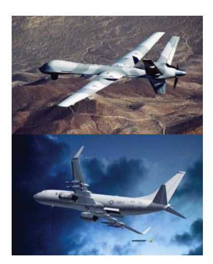
Pneumatic power modules for the Predator/Reaper and P8 Poseidon